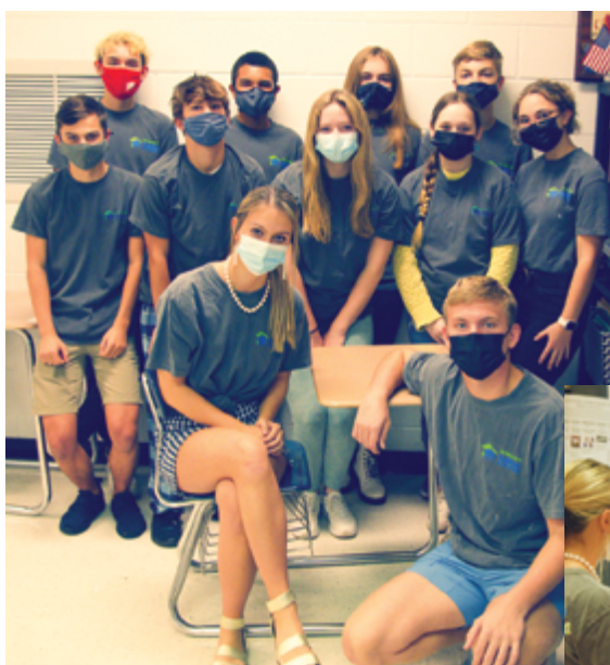
Habitat for Humanity Club members recognized with funding donation

47% of AHS students who took an AP exam scored a 3 or higher